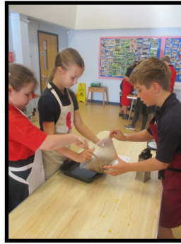
Eagle Owls Making Mince Pies