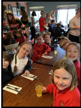
Village Inn Christmas Lunch