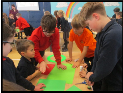
Making the Christmas church decorations