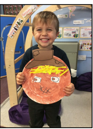
Owlets Harvest Scarecrows