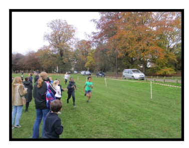
Cross-Country at UEA