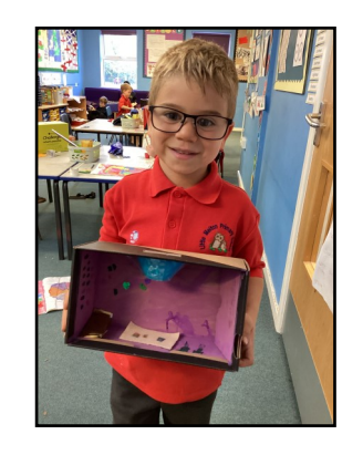
Snowy Owls Homes