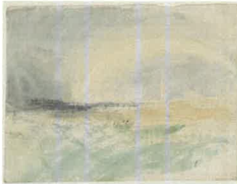
Firing Rockets at Great Yarmouth. Possibly Related to 'Life-Boat and Manby Apparatus Going Off'. 1831. TURNER, Joseph Mallord William (1775-1851)

Exhibition: Drawn to the Coast: Turner, Constable Cotman, Sat 26 May - Sun 9 Sept. Explore Great Yarmouth and its coast through the lives and works of Turner, Constable