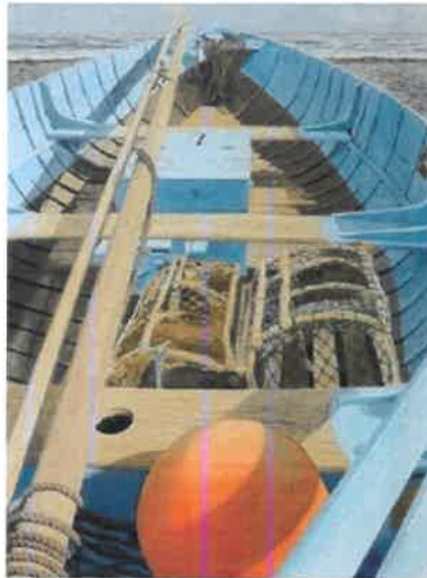
Blue Crab Boat

Continuing Exhibitions: Magritte: The Lost Painting, Extended until 30 Dec 2018. Visible Women, Showing until 11 Nov.